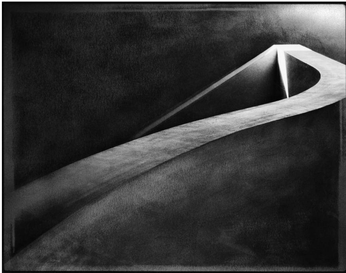
Top: Architectural - Amateur 1st Place - Outstanding Achievement Jared Dastrup - USA Below Manhattan Pier