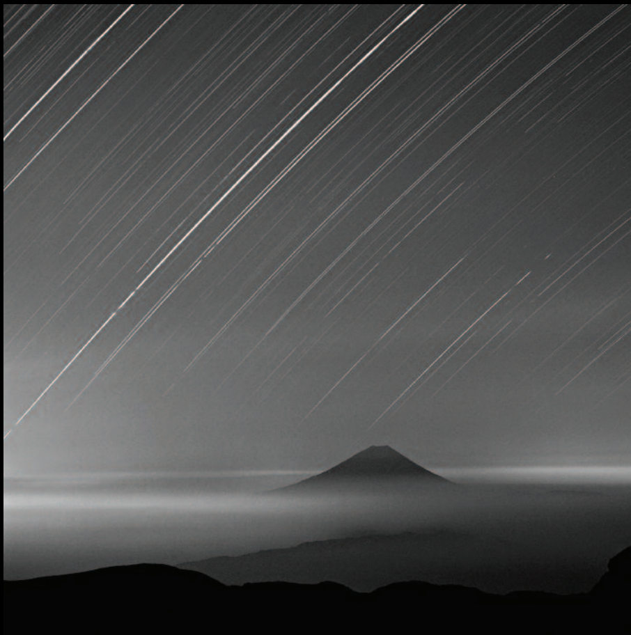
Top: Nature - Professional 1st Place - Outstanding Achievement Ruud Peters - Netherlands Sweet dreams