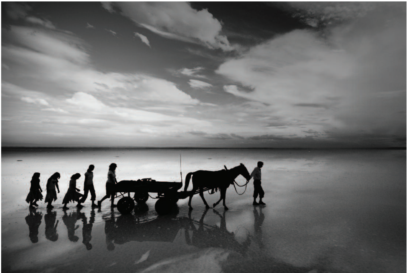
Top: Silhouette - Professional 1st Place - Outstanding Achievement Milos Bicanski - Serbia and Montenegro Belgrade